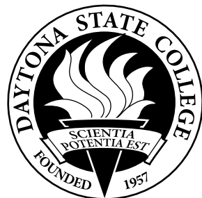
One color/b & w flat seal