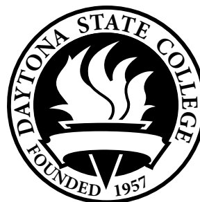
One color seal for embroidery