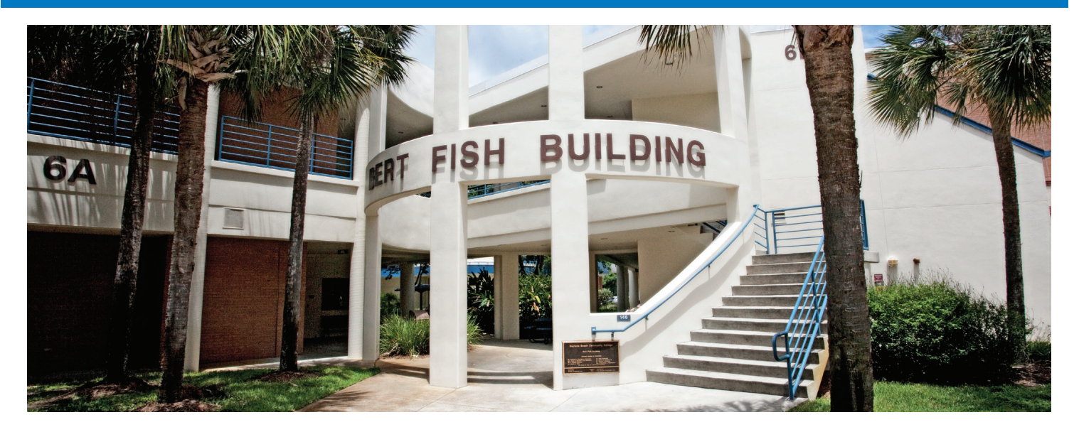
The Dental Hygiene Clinic is located on the DeLand Campus, Bert Fish Hall (Bldg. 6A), Rm. 100